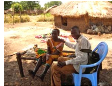
A graduate of the SIM CHW program giving care to a leprosy patient