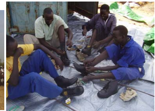
Work boots for the Workshed puts smiles on faces.