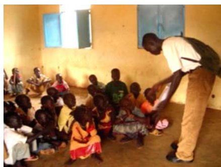
CHW teaching children about flies and the diseases they carry