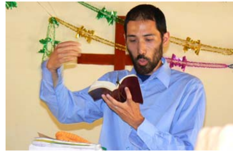
A message from Deuteronomy for the graduating Community Health Workers