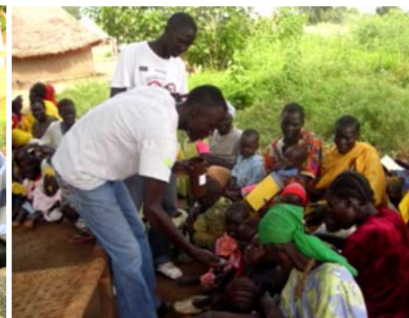
Community Health Workers distributing Vitamin A on Maternal Child Health Outreach Clinic