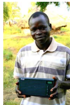
Proclaimer radios with the Uduk New Testament recording distributed