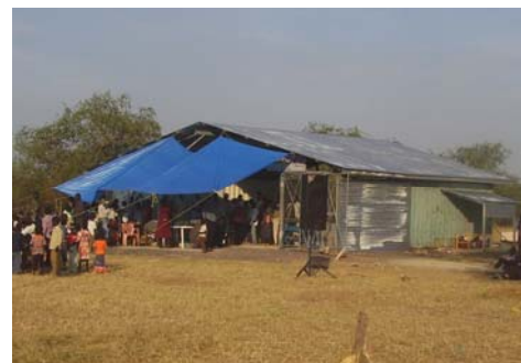
First "Workshed" metal fabrication project starts led by Sudan Interior Aid (SIA)