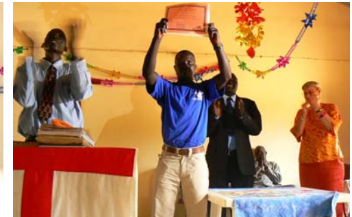
Newly graduated Community Health Worker